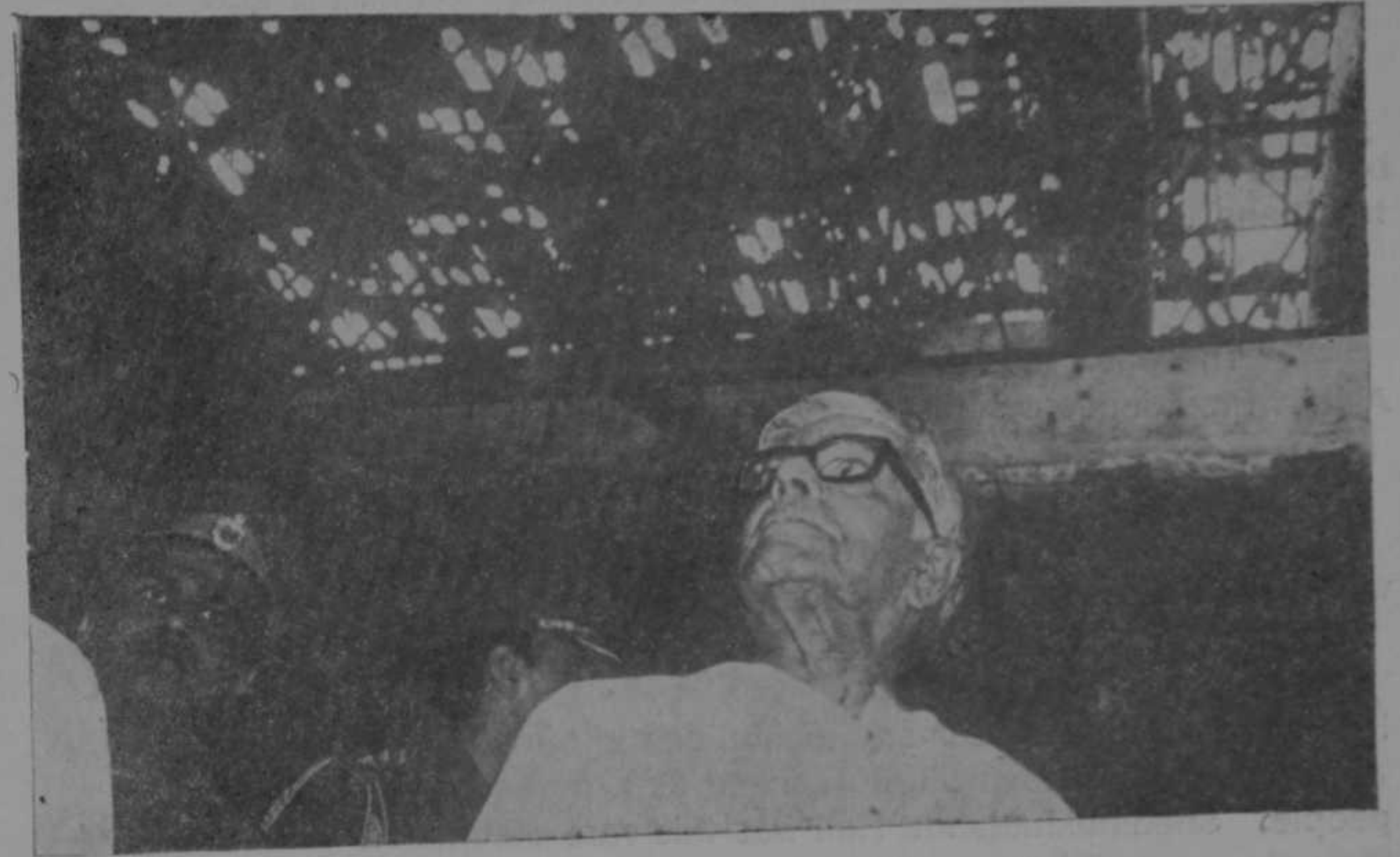
Governor C. Subramaniam . . . "how will it look when rebuilt?" . . .